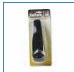
Softalk Telephone Shoulder Rest SamsClub.com