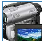
REFURBISHED - DCR-DVD610 DVD Handyc... SonyStyle.com